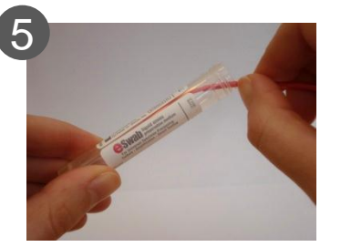
Put pink swab into liquid. Rotate swab against side of tube to release sample into liquid then remove and discard pink swab . Re-cap the tube.