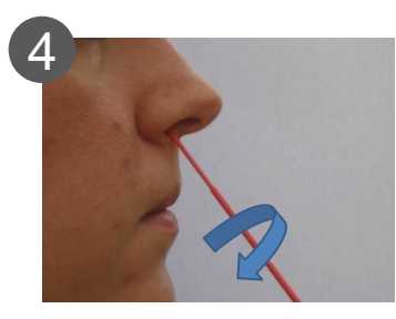
Swab inside patient's nostril, rotating and pressing lightly against inside of nose. Repeat in second nostril with same swab.